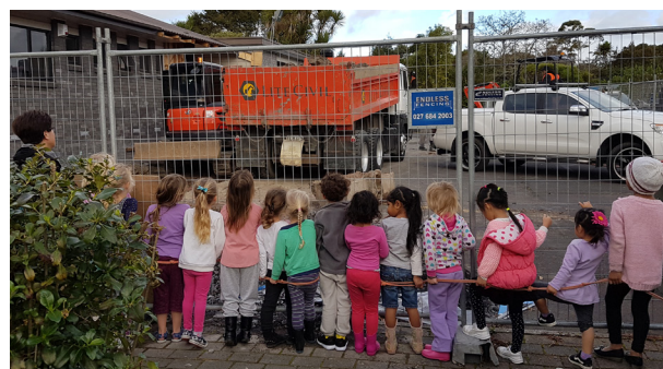
Some of our Kindy kids checking out the church renovations.