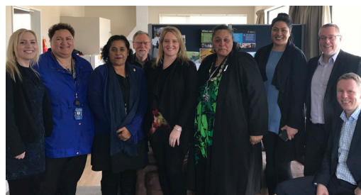
Luke Street Housing hosted a hui on Tuesday 12th September with the Wellington Head Office Ministry of Social Development Team and the Auckland Housing New Zealand Team.