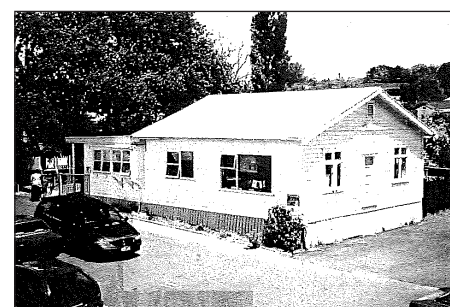
The old Manse became Sunday School rooms and eventually the Kindergarten.

Families benefit from the commitment and care of our dedicated team. This was evident in a recent situation where due to the teachers work with one particular child with special needs, this child has made progress well beyond expectations. The mum expressed her gratefulness to the team for being so supportive and continuously helping her child to improve, and the staff from the Ministry of Education working with this child commended the kindergarten team for being "wonderful teachers". ■